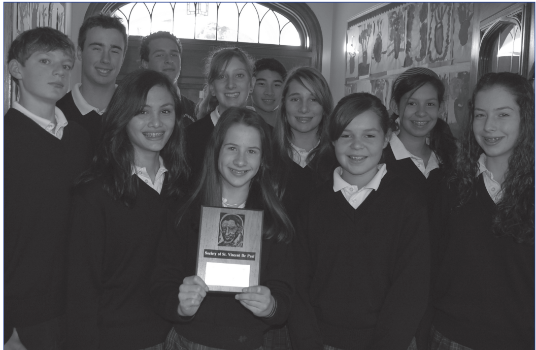
Burlingame's St. Catherine of Siena School received this year's "School Supporter Award" at the annual Ozanam Awards Brunch. Pictured above proudly displaying their St. Vincent de Paul plaque are current student leaders. St. Catherine's was honored for their outreach to the Homeless Help Centers.